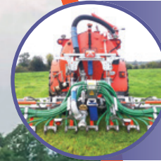
3 Trailing Shoe Applicators