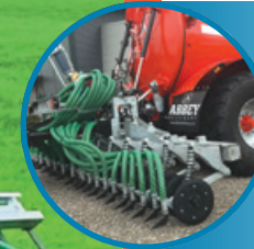
4 Shallow Disc Injectors & Cereal Applicators