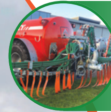
2 Band Spreaders